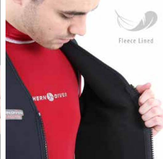
*Please note photos and illustration may change as product develops