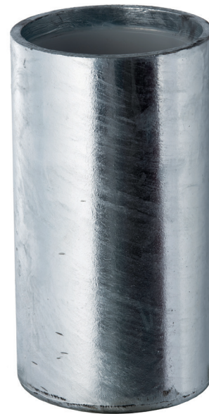
Model Shown: 8000089