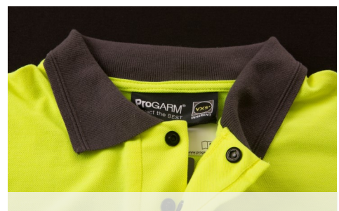
Enclosed fastenings on placket