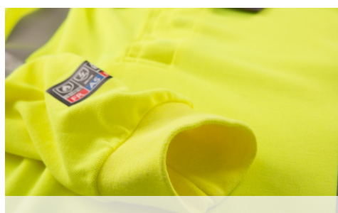
Stretch cuff with Lycra