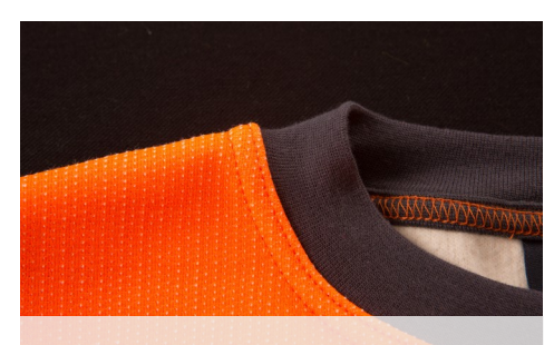
Twin needle stitch on neckline