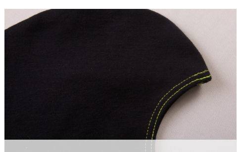
Double stitching for longevity