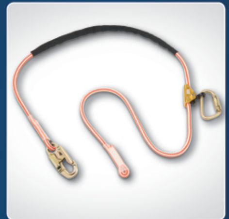
1234070 Adjustable Rope Positioning Strap (Meets OSHA 1910.268(g), 1926.502(e), & 1926.959)