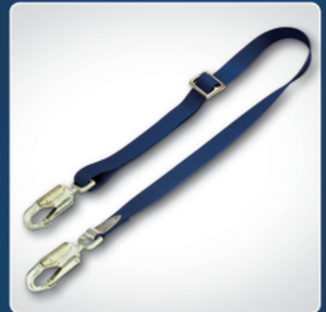
1234030 Adjustable Web Positioning Strap