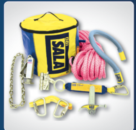
2104800 SafLok™ Pole Anchor System Meets ANSI Standards—USA