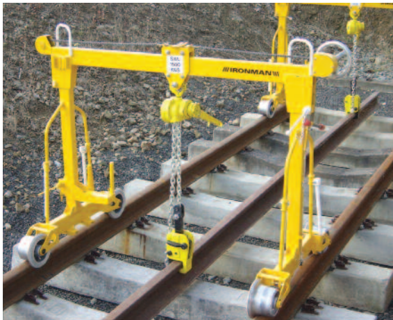
Typical application shot showing a CR1000 in use with a Yale D85 Pul-lift and an 'Iron man'.