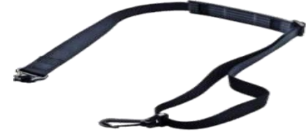
Extension strap (4 ft./1.2 m) GA-ES-1