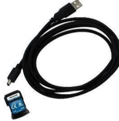
IR Connectivity Kit GA-USB1-IR