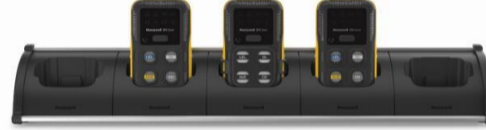
5 way cradle charger,BW ICON/ICON+ CP-C01-5