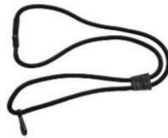
Neck strap with safety release GA-NS-1