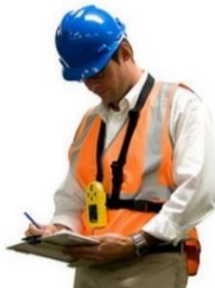
Chest harness GA-CH-2