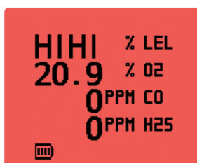
Red display in alarm conditions