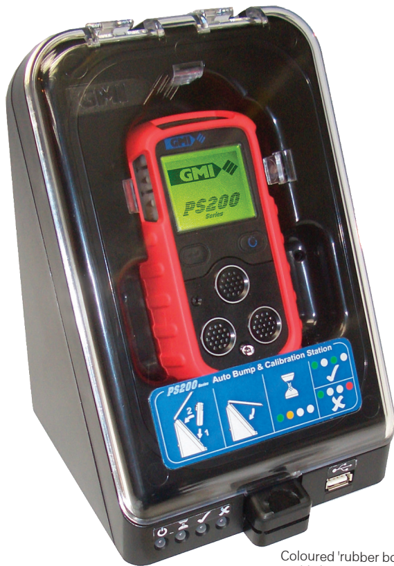
Coloured 'rubber boot' for multi-site or multi-application working (7 colours available)

To complement the Personal Surveyor product line, Tyco Gas & Flame Detection has developed a compact, robust and easy to use Auto Bump & Calibration Station that can provide full bump and calibration options. Data transfer is facilitated using a USB memory stick with Standalone software that is simple to set up and customise based on end users' specifications. Standalone, PC, and ethernet versions are available.