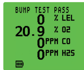
Configurable bump options