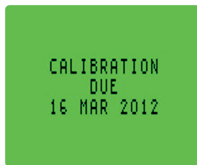
Configurable calibration options