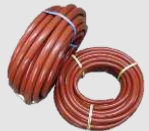
19mm & 25mm Hose Reel Tubing