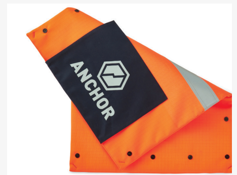
Anchor element to allow for safe setup of the arc cover