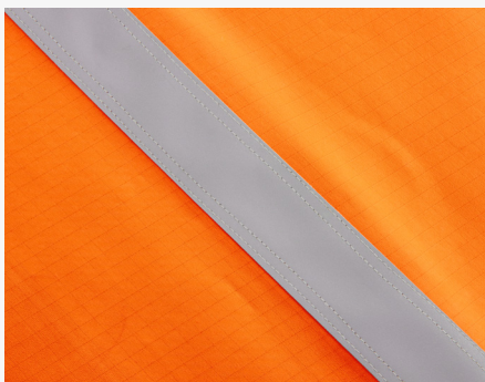
Double stitched ThermSAFE™ reflective tape for longevity