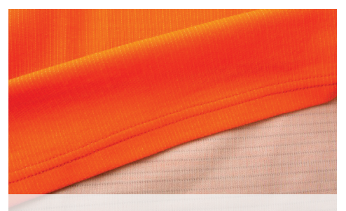
Ultra - soft and durable VXS+ Fabric