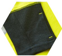
Open cuffs for a relaxed fit