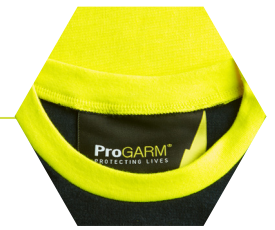
Traditional round neck rib collar