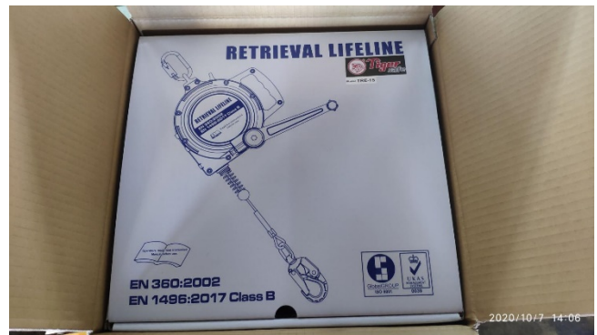
Double boxed packaging

Due to our policy of continual product development, dimensions, weights and specifications may change without prior notice. Please check with your Tiger sales team when ordering.