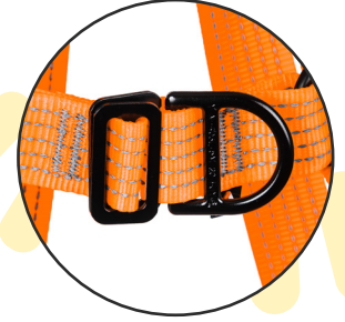
Front attachment point