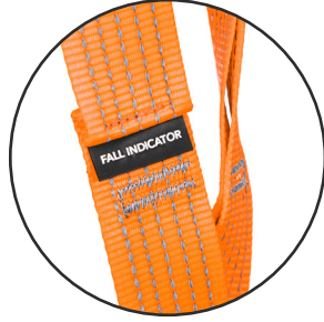
Rip stitch indicators