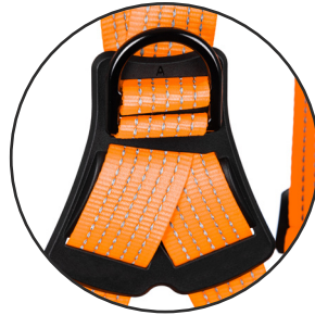
Rear attachment point