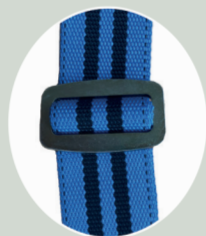
Three Bar Slide