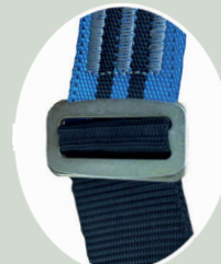
Three Bar & Square Link