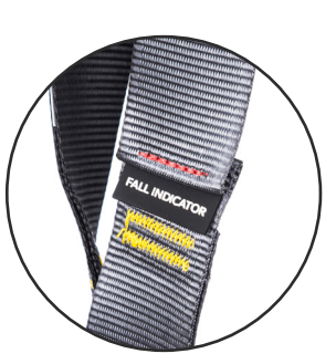
Rip stitch indicators