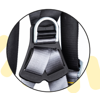
Rear attachment point