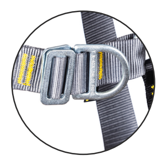
Front attachment point