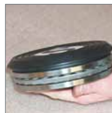
Ball bearing for turning plate