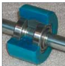
Rollers with ball bearing