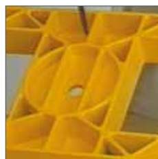
Chassis from ductile graphite iron