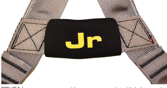
PBH31 harnesses come with a neoprene printed label cover, in place of the label pouch found on PBH30 harnesses. The "Jr" print is large for fast identification of size.