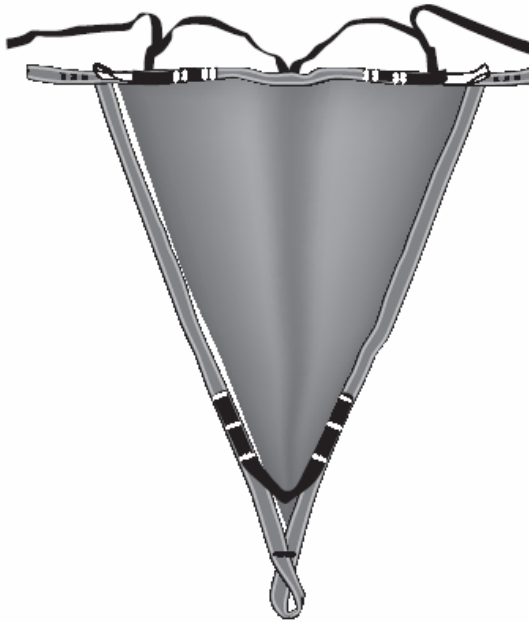
HT9 rescue triangle code 17622