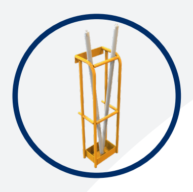
Strip Light Bulb Holder

Keep tools safe and secure whilst working at height