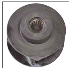
Load chain sheave with needle bearing