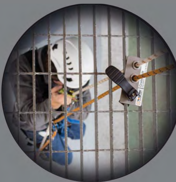
Gratemate: Standard (MR60), Quick Fit (MR60Q)