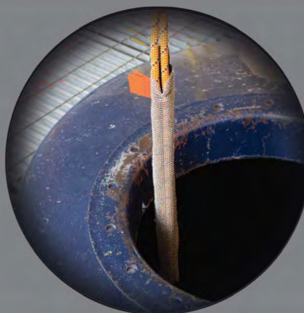
Sentinel Chainmail (MR705)