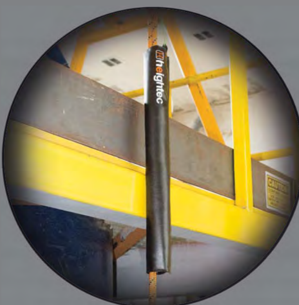
Sentinel Chainmail (MR705) with cover: Black (MR705P), Clear (MR705C)