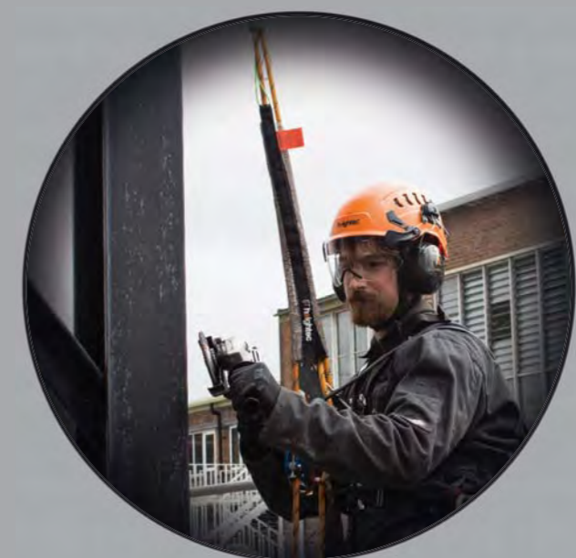
Sentinel Chainmail (MR705)