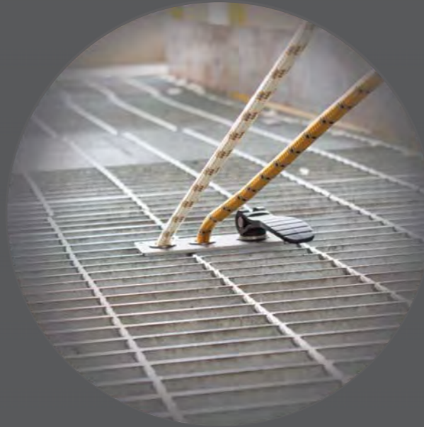
Gratemate: Standard (MR60), Quick Fit (MR60Q)