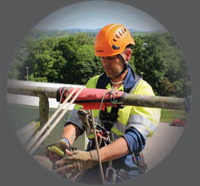
Square Canvas (RPS)